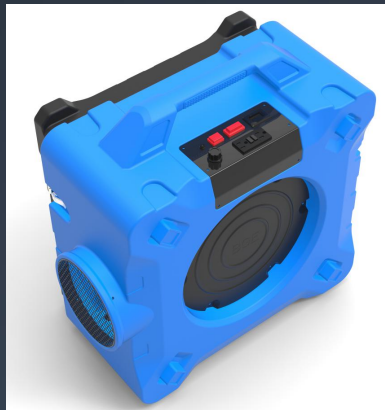
Top Back Side

Air inlet with filter cover protection, smart lock design for convenient filter replacement operation.