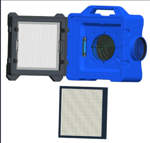
4 in-1 True HEPA Filter & UV-C Light Air Scrubber

It features a highly effective 3 Stage Filtration System, Pre Filter, HEPA/Activated Carbon Filter.